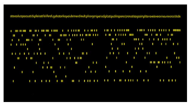
Image 5: Augusto de Campos "cidadecitycité", digital transcreation by Erthos A. de Souza (1975)

These reflections on a theoretical and methodological framework for poetry translation in public space can subsumed under the aforementioned key concept of transit-translation. the following examples, will associate four poetic expressions from four related cultural areas, with non-lyric discourse visual, verbo-visual and