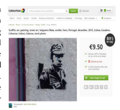
Image 9: anonymous, [Salgueiro Maia], foto by P. V. Martins (Lisboa, 2012)

of the transit-translation process encompass not only translatability and misunderstanding, but also the intentional abuse at reception level, even more so when we see it was taken by a certain P. V. Martins, from the same country affected by the crisis and the accompanying misery (Image 9).