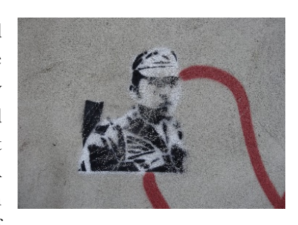
Image 8: Anonymous, [Salgueiro Maia] (Almada, 2013)

Political paintings and graffiti had marked Portugal's urban landscape in the years following the 1974 Revolution.21 The onset of the 21st century economic crisis saw their proliferation diversification, making Lisbon one of the most important spaces internationally for street artists. A noteworthy painting from this second wave is an anonymous graffito which shows a likeness of Fernando José Salgueiro Maia, one of the revolution's most emblematic captains (Image 8). In the current climate marked by controversial Troika imposed austerity and excessive European Union control, poverty has rapidly increased, coinciding with a significant loss in Portuguese national sovereignty. Evoking the revolutionary significance of this now legendary figure was a clear and subversive demand for a second revolution. Ironically, or indeed cynically, photographs of the graffiti appeared on sale on a microstock agency website almost simultaneously. The appropriation and commercialisation of this artistic action's poeticpolitical discourse illustrates how the hermeneutics