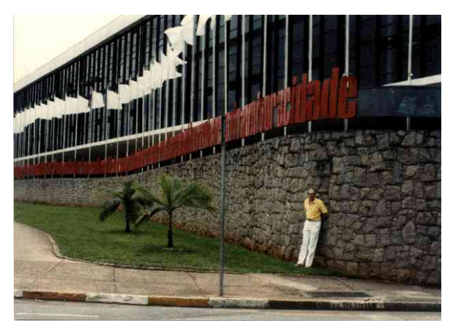
Image 6: Augusto de Campos, "cidadecitycité", installation by Julio Plaza at the São Paulo Biennial (1987)

The enacted transittranslation affects the language itself, since the final words acquire both a noun value and a suffix value in their respective languages, thereby enabling both interlinguistic and intralinguistic transpositions. In each of the languages the poetic phenomenon simultaneously designates and translates the city,