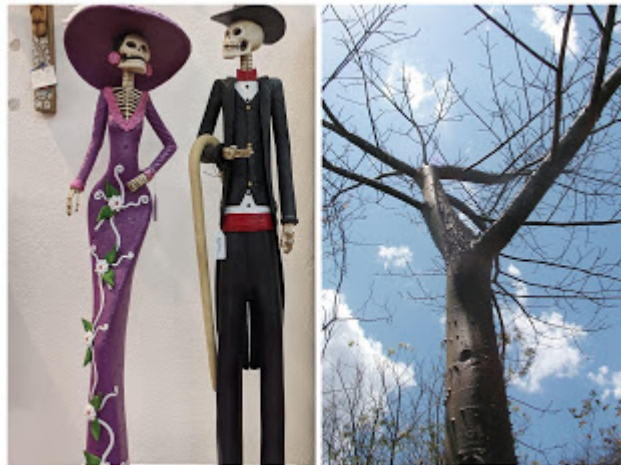
Figure 2. Choices which each of us faces as we retire, age, die

Like it or not, every one of us is destined to change in a major way as we age, retire and die. Many religions tell us that we will be the same person after we die, but first person experience tells me that I already change in a major way from periods of clarity and attunement in early morning to late night periods of exhaustion, especially after alcohol. The noosphere species model essentially predicts that when we die the Alchemical marriage also ends, leaving one part alive but only one part. What is the destiny of that part?