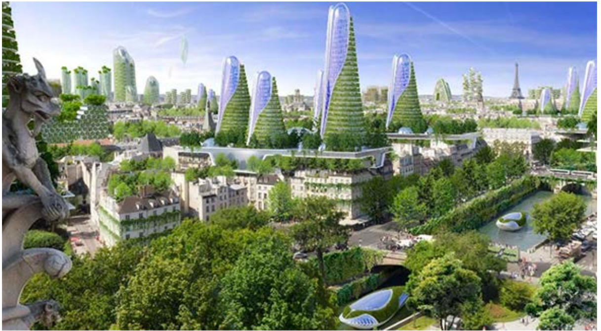
Figure 2: ‘Paris Smart City 2050’, by Vincent Callebaut (2014).

A particularly good example is a series of renderings made by Vincent Callebaut, in which we see a green and sustainable future version of Paris, for example: