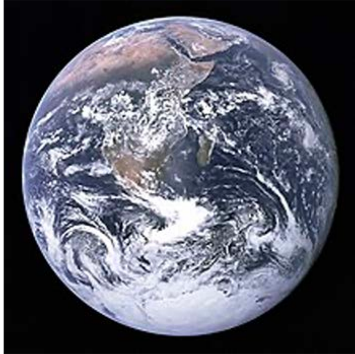
Figure 1: ‘The Blue Marble’, i.e., the Earth as seen by the crew of Apollo 17 in 1972

[In 1987,] Frank White coined the term “Overview Effect” to describe the cognitive shift in awareness that results from the experience of viewing Earth from orbit or the moon. He found that, with great consistency, this experience profoundly affects space travelers’ worldviews—their perceptions of themselves and our planet, and our understanding of the future. White found that astronauts know from direct experience what the rest of us know only intellectually: we live on a planet that is like a natural spaceship moving through the universe at a high rate of speed. We are, in fact, the crew of “Spaceship Earth,” as Buckminster Fuller described our world. (AIAA, 2014)